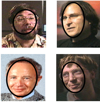
Figure 5: Faces with different features