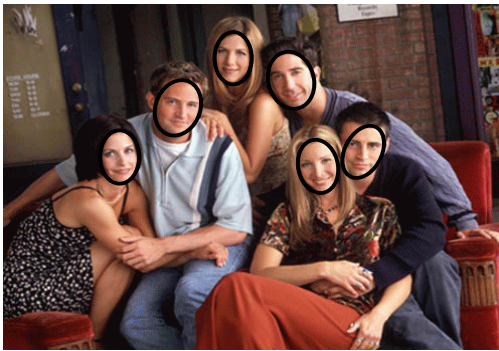
Figure 6: Human faces in complex background