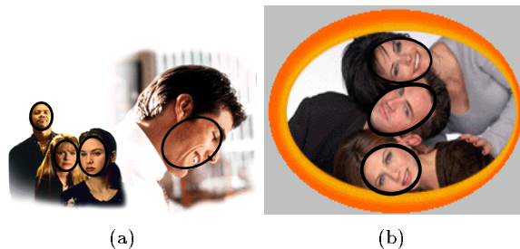
Figure 4: Faces of different size and orientation

on color images collected from the Internet. Each detected human faces is shown with an enclosing ellipse. Figure 4(a) shows that human faces of different viewpoints and sizes are detected. Note that faces of different ethnic backgrounds are detected. Faces of different orientations can also be identified as shown in Figure 4(b) Figure 5 gives an example that human faces with glasses and sideburns can still be detected. Finally, Figure 6 demonstrates that human faces can be extracted in a color image with complex background.