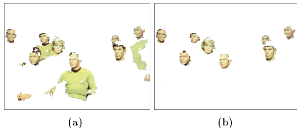
Figure 3: Intermediate and final results of face detection

In this section, we present experimental results (color images of the experiments can be found at http://uirvli.ai.uiuc.edu/mhyang/facedetection.html )