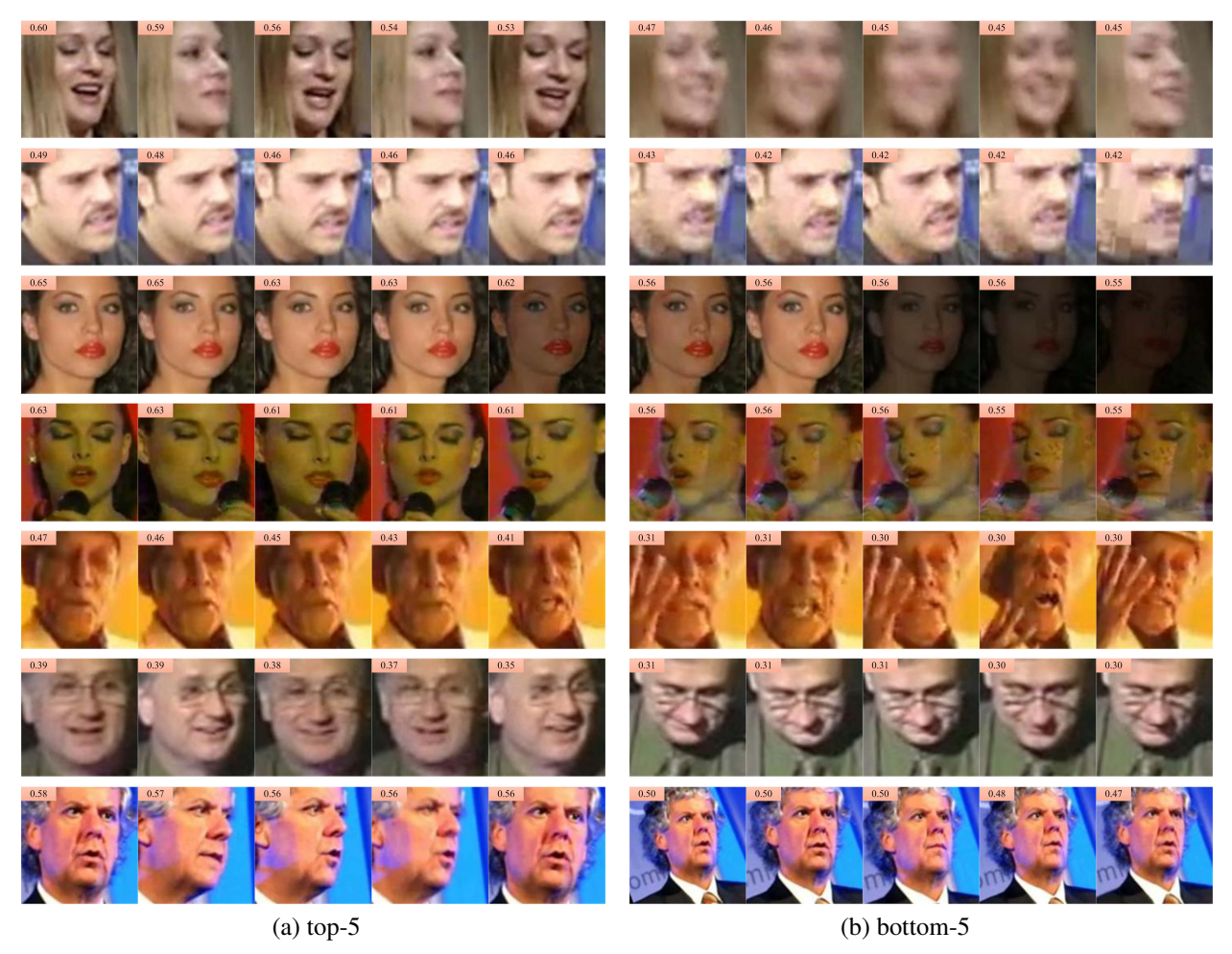
Figure 3. We sort the frames within a sequence in a descending order with respect to the discriminator-guided weights (\mathcal{D}(y=1|v)) , and display them by showing the top-5 and bottom-5 instances, respectively. The weights are shown in the upper-left corner of each frame. We visualize eight video sequences that illustrate the following video quality degradation: blurring , compression noise , lighting variation , video shot-cut , occlusion , detection failure , pose variation and mis-alignment from the first to the last row.

preprocessing. By removing poor quality images based on localization errors, we obtain much higher verification and identification results. However, the gap between our proposed model and the baseline is reduced, which we believe is due to low-quality images being mostly filtered out, so the baseline method can still work fine or even better. Compared to previous works, the performance of our proposed method is competitive under similar training and testing protocols [34, 1]. Further improvement is expected by training a stronger base network on larger labeled image datasets [39] or with other types of synthetic data augmentations such as pose variation with 3D synthesization [23].